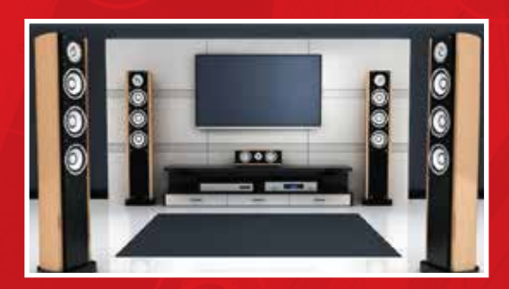
Audio Video system